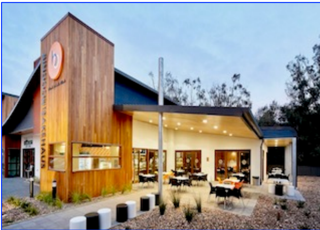
The Bindoon Bakehaus