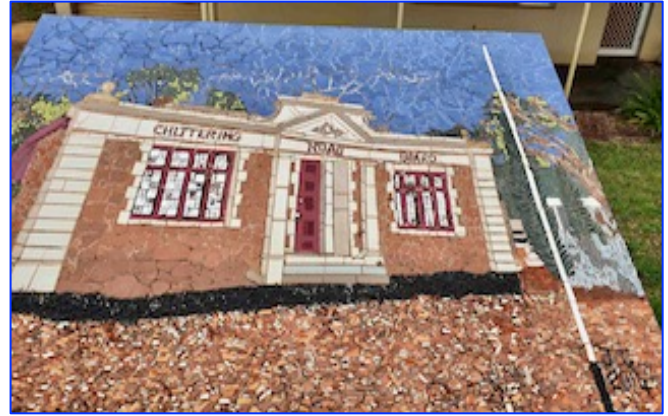
The very well maintained historic Chittering Road Board building and a mosaic replica.