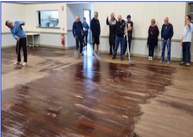
Many hands make light work! The big clean up.