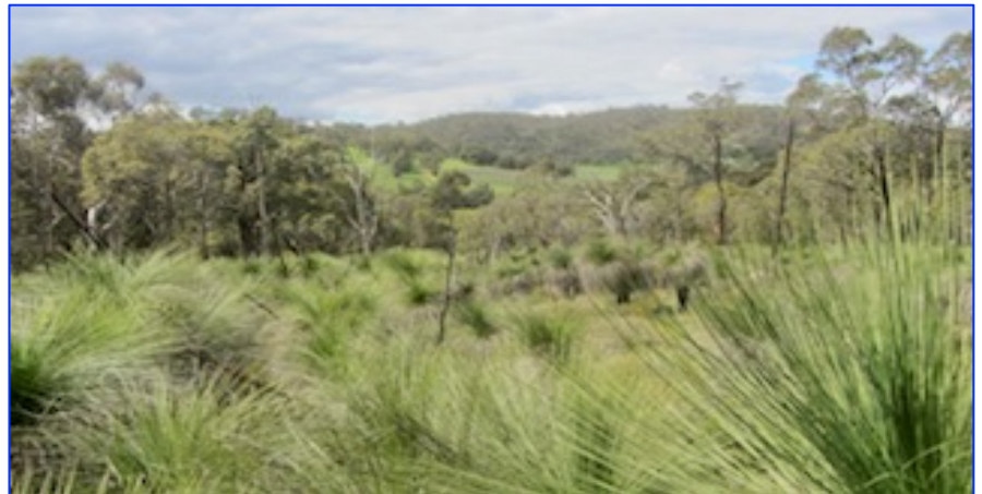
The view from the top was certainly worth it.

Back at camp we sat back and enjoyed a wine tasting by friends of Jim and Helen who own a small local winery named Glenowen. Dan and Gail Dam's farm is located in the Darling Ranges about 15km North of Bindoon just off the Great Northern Highway. It is situated in a lovely valley at the end of a cul-de-sac. The vines on Glenowen farm are very old, dating back to the early 1900s. Some were grafted to produce currants for the dry fruit industry but most have been producing wine grapes for a very long time. In 1995 the currants were converted back to Shiraz wine grapes, their original rootstock.