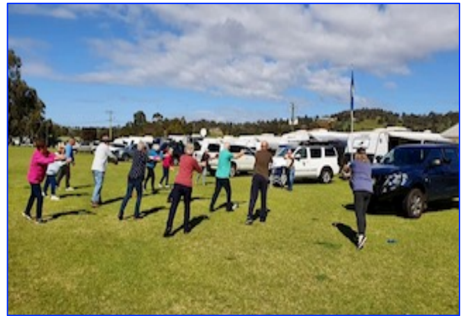
Tai Chi is a great way to start the day.